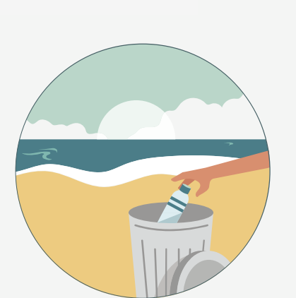
Enjoy the sea, nature and town, but leave nothing behind.