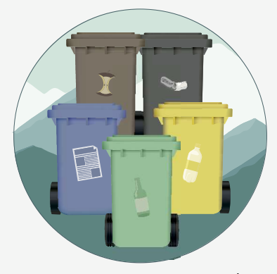
Separate your waste and carry a bag for your rubbish when you go on outings.