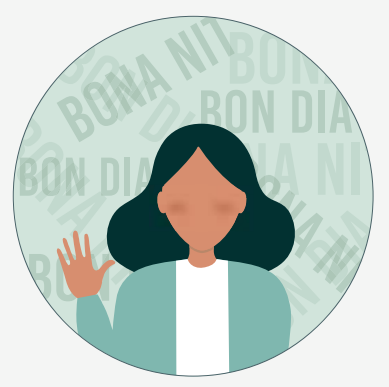
A 'good morning' or 'good evening' can kick off a friendly conversation.