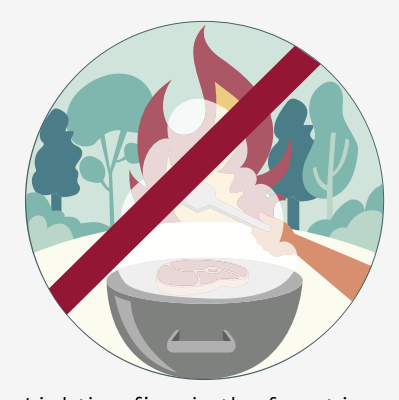
Lighting fires in the forest is forbidden, and you must take care with barbecues at home.