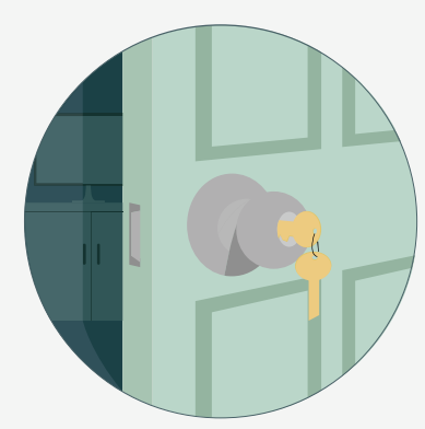
Shut all doors and windows properly and do not leave valuable objects in view.