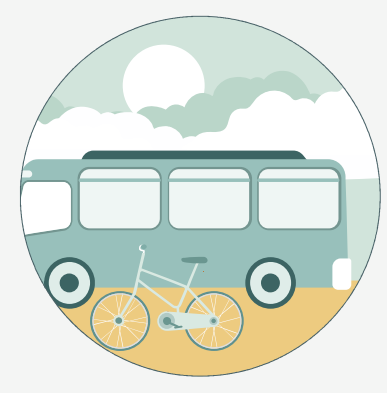
Get around by walking, cycling or using public transport. It's healthy and good for the environment.