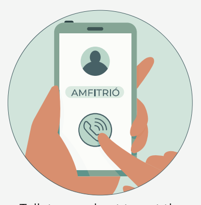
Talk to your host to get the most out of your visit.